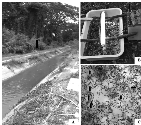
Fig. 1 Photographs of the sampling site (A) light traps (B) and specimens contains in the white tray (C).

a dissecting stereomicroscope. Specimen identifications were accomplished at the species level using Malicky (2010). Specimen counts from collections at each sampling month were summed. Abiotic factors (air temperature, precipitation, relative humidity and wind speed) in this study were obtained from Nakhon Pathom Meteorological Station year 2016, which is located nearby the sampling site.