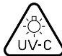
Fig.2 Warning sign light

et al., 2014). Notably, these technologies developed for use in health-care settings are used during terminal cleaning (cleaning a room after a patient has been discharged or transferred), when rooms are unoccupied for the safety of staff and patients (WHO, 2020b).