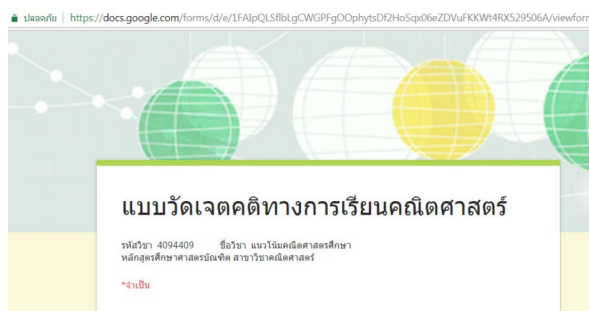
Figure 3 An evaluation form on attitude toward mathematics used in this study (Ruangnun, 2017b)

Data collection process. The researcher collected the data in this study by herself. The data collection process started with evaluating students' attitude toward mathematics at the beginning of the course. The evaluation form was an online evaluation published in google form as shown in Figure 3.